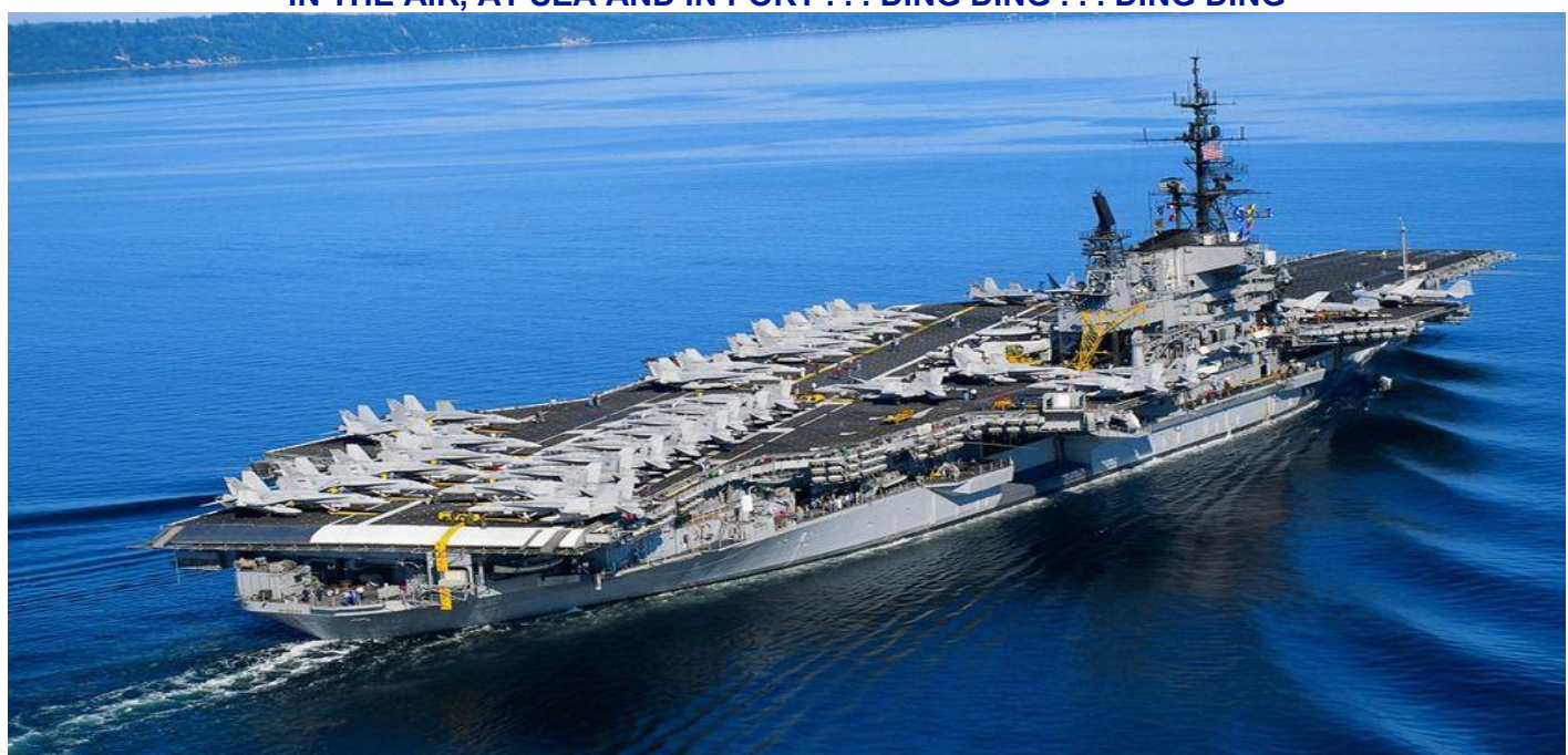
Shift Colors, Underway!

DING DING . . . DING DING . . . SHIP'S CREW ARRIVING . . . ABOVE AND BELOW DECKS IN THE AIR, AT SEA AND IN PORT . . . DING DING . . . DING DING