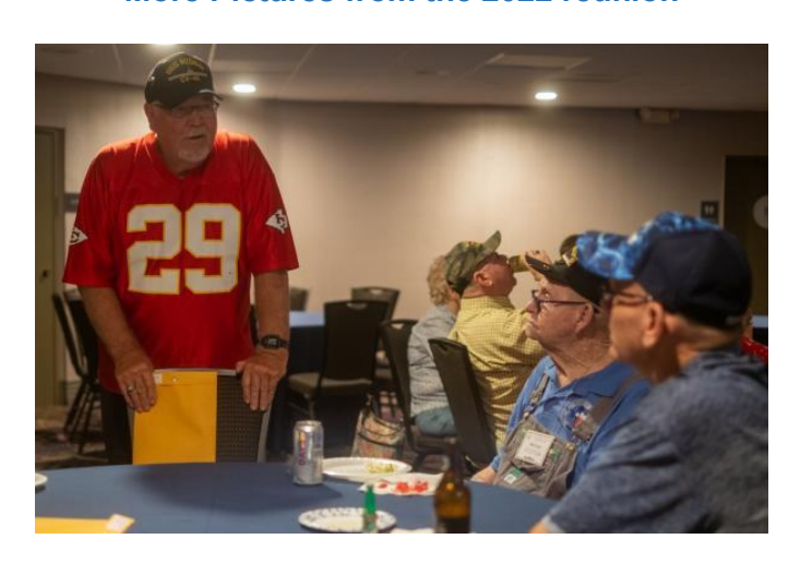
Telling tall tales in the Hospitality Room