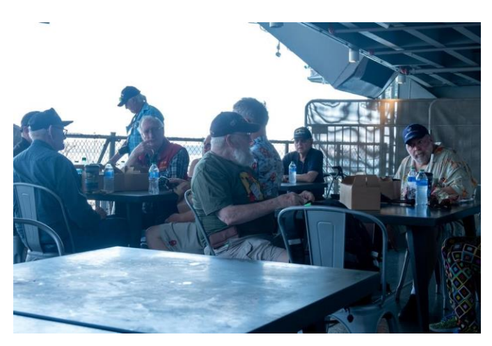
Chowing down on Café 41 lunch on L-3

I don't know what exactly happened afterwards, but the two had to meet with the XO. They didn't get written up, but I am sure the XO chewed them out good!