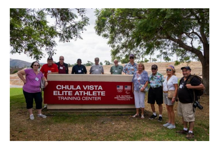
Reunion attendees at Chula Vista Training Center