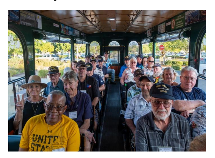
Reunion attendees enjoying a Trolley ride around San Diego