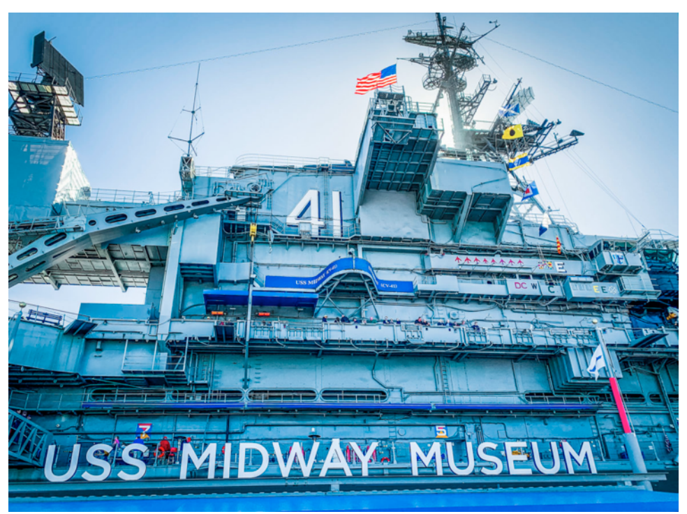
The USS Midway Veterans Association Promotes and Supports the USS Midway Museum

DING DING . . . DING DING . . . SHIP'S CREW ARRIVING . . . ABOVE AND BELOW DECKS IN THE AIR, AT SEA AND IN PORT . . . DING DING . . . DING DING