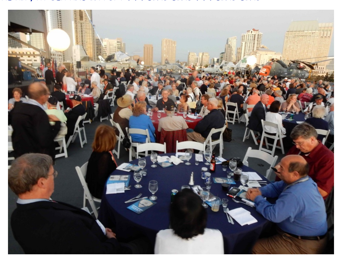
Dinner on the flight deck at MVA's 2017 reunion. No one left the ship hungry or bored after this event.

DING DING . . . DING DING . . . SHIP'S CREW ARRIVING . . . ABOVE AND BELOW DECKS IN THE AIR, AT SEA AND IN PORT . . . DING DING . . . DING DING