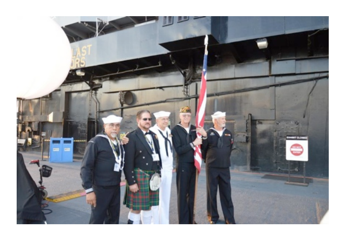
MVA Color Guard, assembled in 2013 for MVA's San Diego reunion.

Both men are up for reelection at this reunion. They will have served four-year terms. The election will be held at Wednesday morning's Business Meeting.