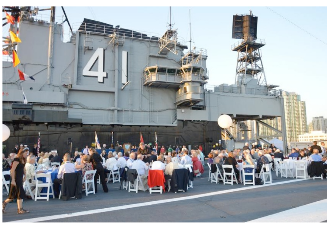
Dinner on the flight deck under the "Big 41 at MVA's 2013 reunion

DING DING . . . DING DING . . . SHIP'S CREW ARRIVING . . . ABOVE AND BELOW DECKS IN THE AIR, AT SEA AND IN PORT . . . DING DING . . . DING DING Reunion Reg. Form available on last page of this newsletter.