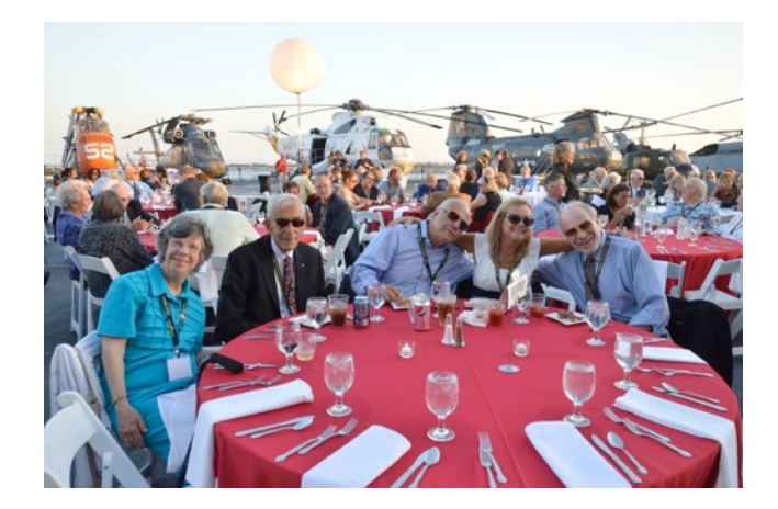
Table of happy MVA banqueters waiting for the banquet to began, circa 2013 reunion.

ATTENTION: The registration form for our 2017 San Diego reunion is included as the last page of this newsletter. To use the form to register, remove the page, complete, and mail in with your check to AFRI's address on the form. OR register by credit card by opening the top link on the form: (https://www.afr-reg.com/midway2017/)