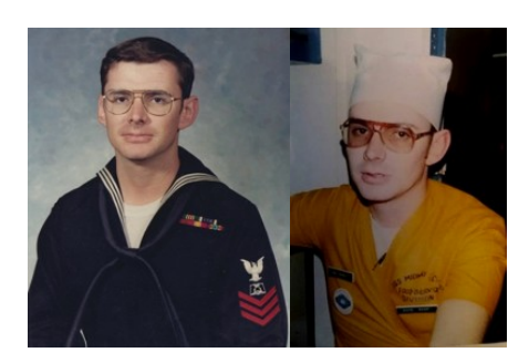
From USS Midway Cook to Historical Memorial Preservationist