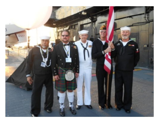
Midway Veterans' "Color Guard" Assembled, Flight Deck, USS Midway Museum, Sept. 14th, 2013

DING DING . . . DING DING . . . SHIP'S CREW ARRIVING . . . ABOVE AND BELOW DECKS IN THE AIR, AT SEA AND IN PORT . . . DING DING . . . DING DING