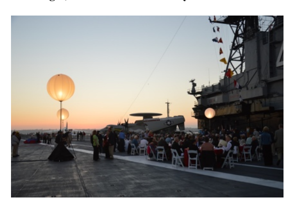
Sunset on the Flight Deck