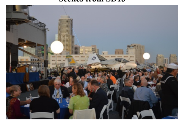
Just before dinner on the flight deck