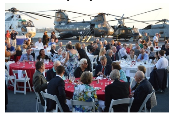
Midway veterans, families and friends converse and eagerly await their dinner on the flight deck under a "canopy" of choppers