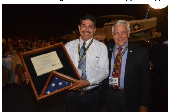
This lucky veteran won an American flag flown over Midway