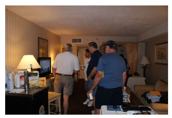
The keg-o-rater on left. Ready to serve

The day before the reunion, the HR, the nerve center of the reunion and aptly named, took shape, complete with a large poster listing food and beverages available as well as the rules and regulations to be observed in the place (one example: No passing out in the middle of the room. We will walk on you.)