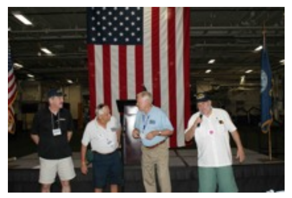
Reunion group officers in Hangar Bay 1

Perhaps the most memorable moment of the hangar bay ceremony came when we honored the three plankowners in attendance. It was an inspiring moment. Nor would it be the last time we honored them during the reunion. This acknowledgment on their ship, by their shipmates, family members, and friends had to be a profound experience for these men, and the tears on both sides of the handshakes were genuine.