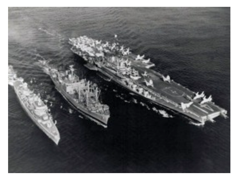
USS Midway completes UNREP with DD outboard

DING DING . . . DING DING . . . ALL CREW ARRIVING . . . ABOVE AND BELOW DECKS . . . IN THE AIR, AT SEA AND IN PORT . . . DING DING . . . DING DING . . .