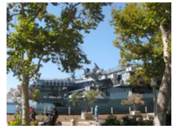
Midway - seen from the park, framed by trees

By 1500, we were ready for R&R back at the hotel to recharge our batteries. It had been a long day on the ship, and the keg-o-rater, sea stories, and maybe a quick nap in our room awaited us.