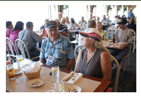
Reunion crew chowing down at Anthony's