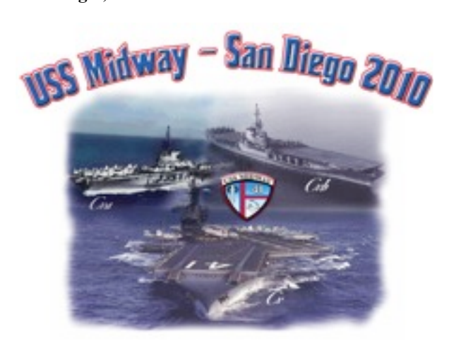
The emblem/logo of the USS Midway Reunion Group for the 2010 reunion